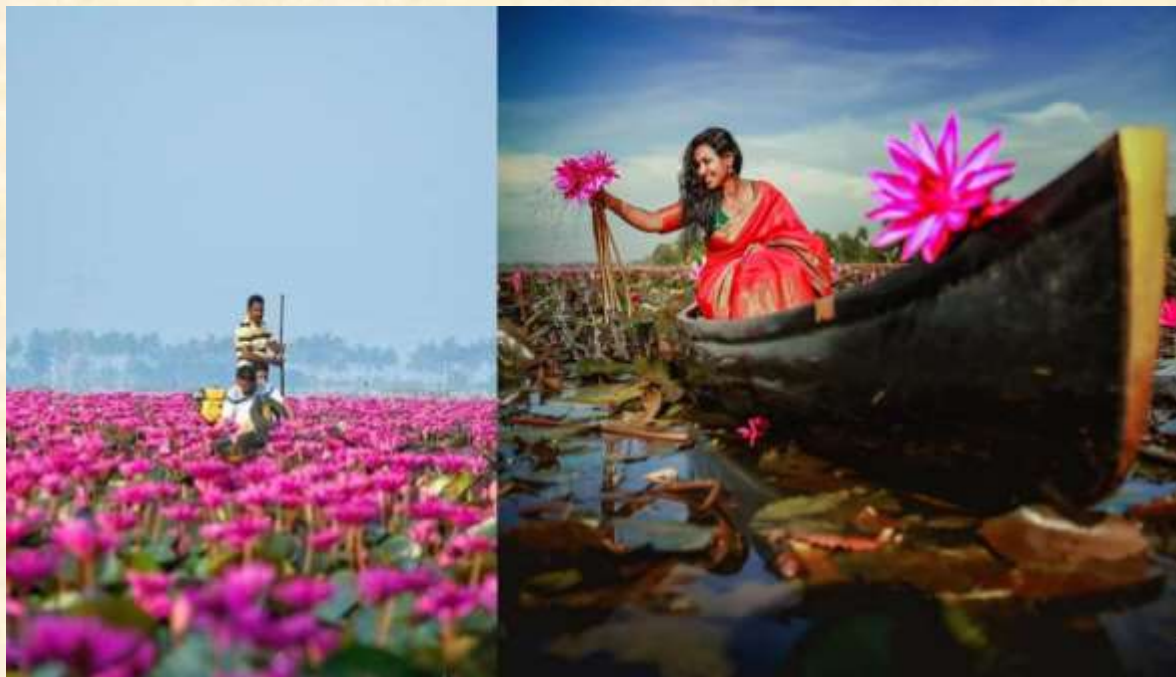
MALARIKKAL VILLAGE TOURISM