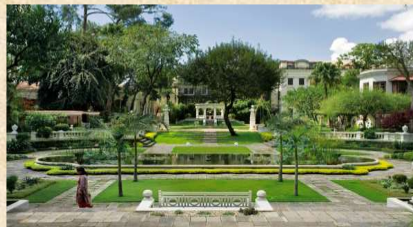
Garden of Dreams