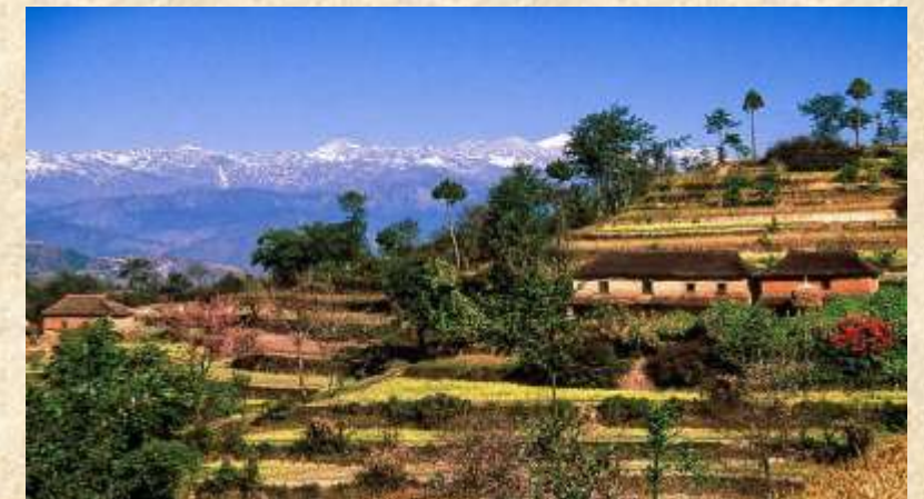
Nagarkot, Kathmandu Valley