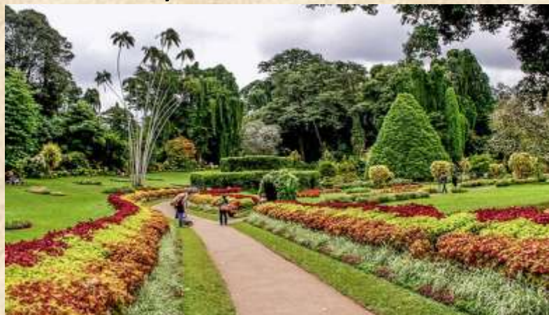
Royal Botanical Gardens